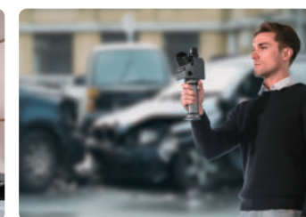
Public Safety and Forensic Investigation