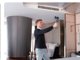
Interior Design and Renovation